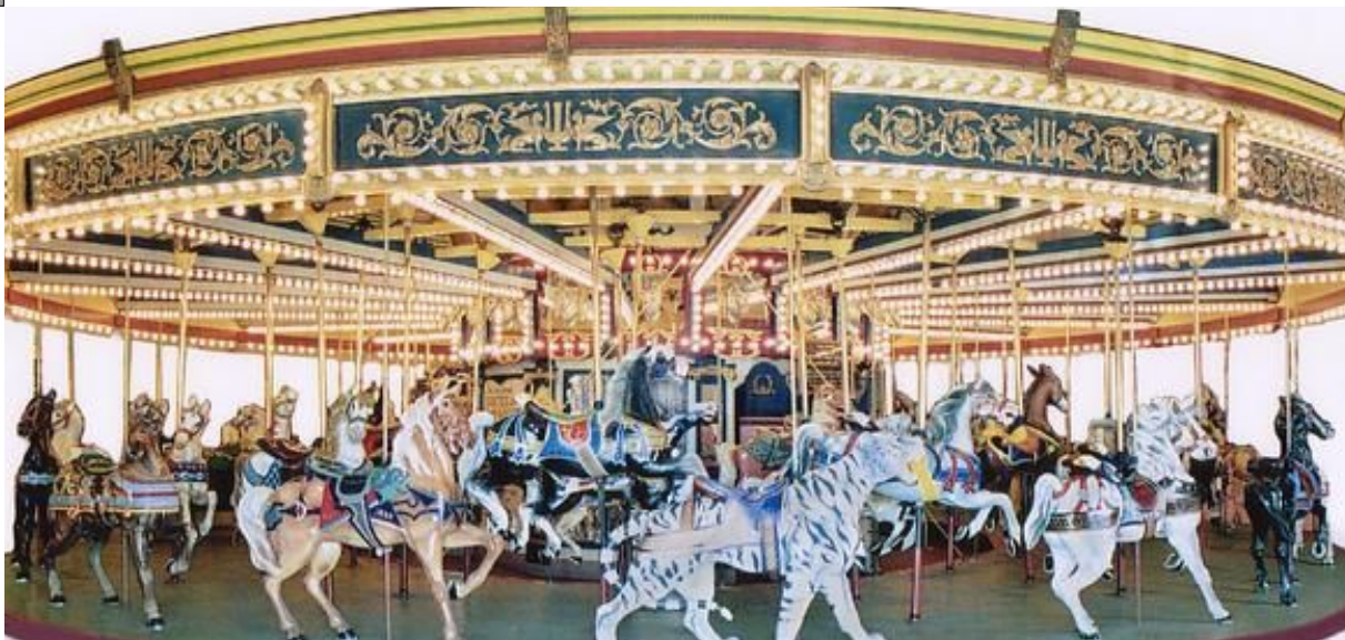
Circa 1910 Dentzel/Looff Carousel

International Rides Management is proud to exclusively offer a unique opportunity.